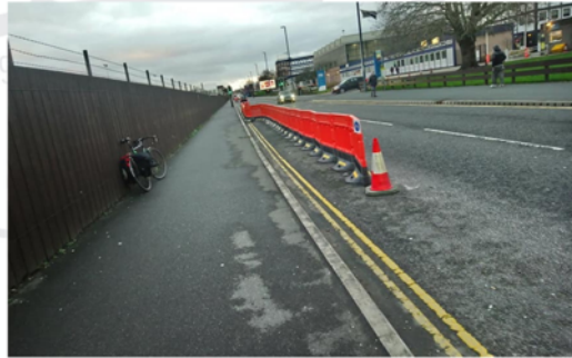
Derby Cycle Group AGM - 18th May 2021